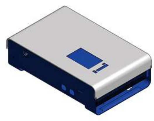
Example of the housing RF450